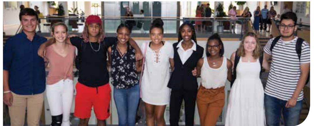
(bottom right) Ava's Grace Scholars were awarded grants at the 8th annual awards ceremony for the program, which creates scholarships for students who have experienced parental incarceration.