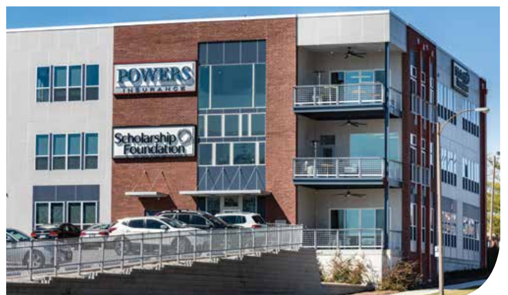
The Scholarship Foundation's present home on Clayton Avenue