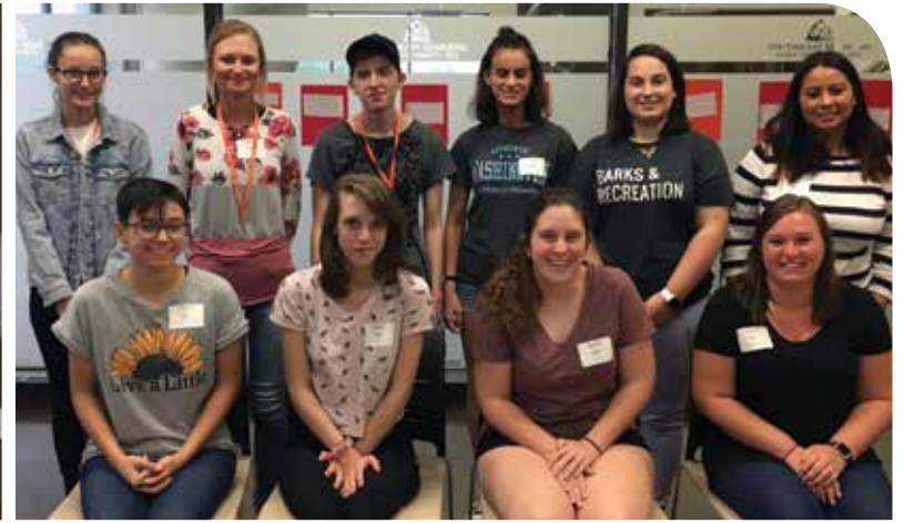
(top left) In August, BJC HealthCare hosted an awards luncheon for the third class of BJC Scholars and their families at The BJC Learning Institute.