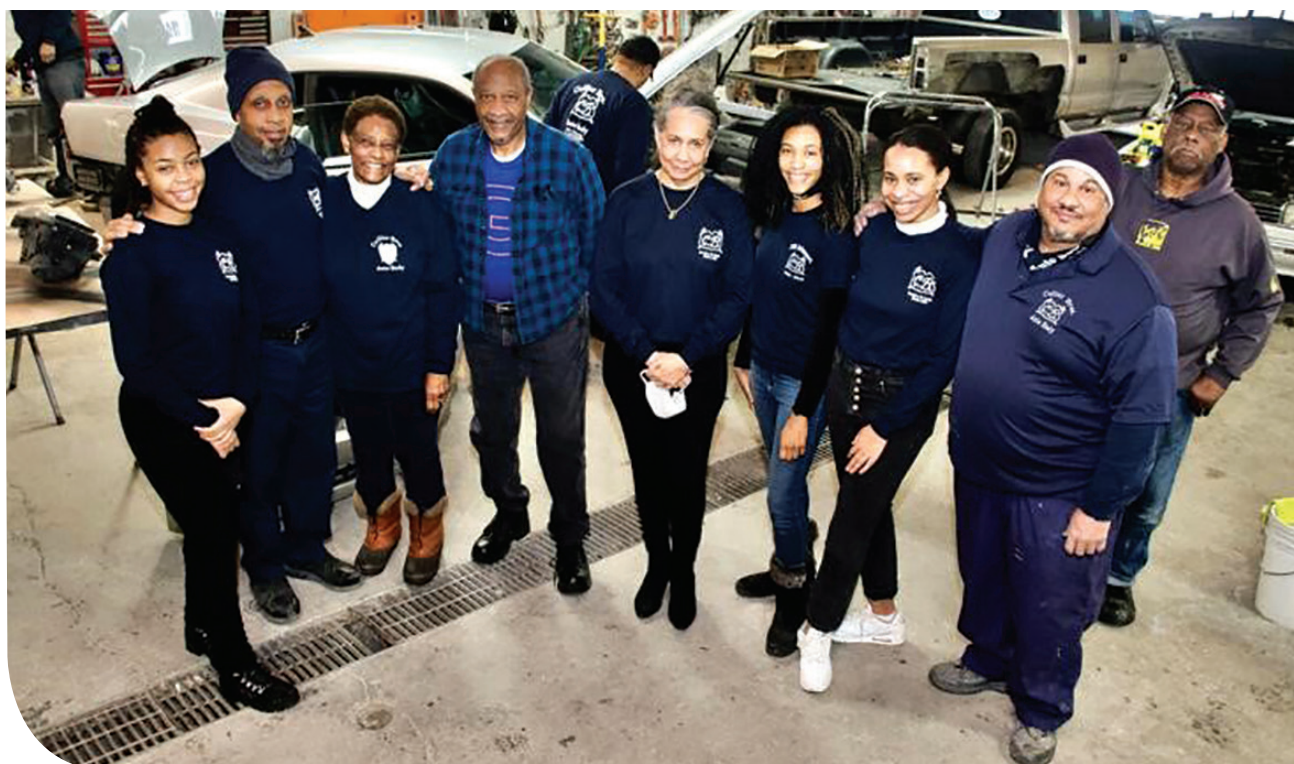
The Collier Family at the shop

"The endowment is a celebratory full-circle moment in which we can invite and support and build up together."